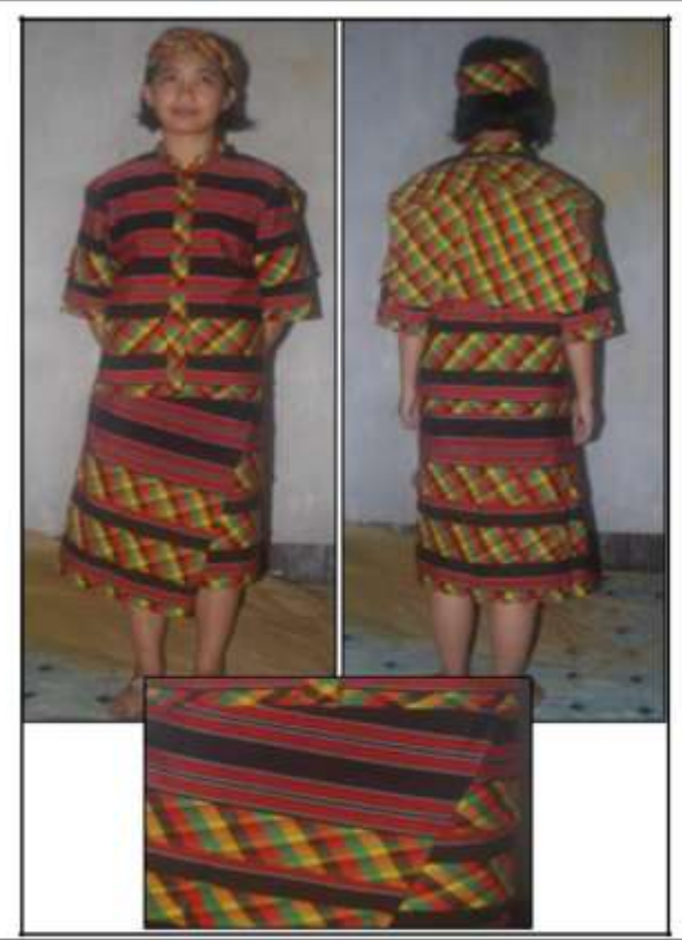
Figure 4. Clothing for women with high status