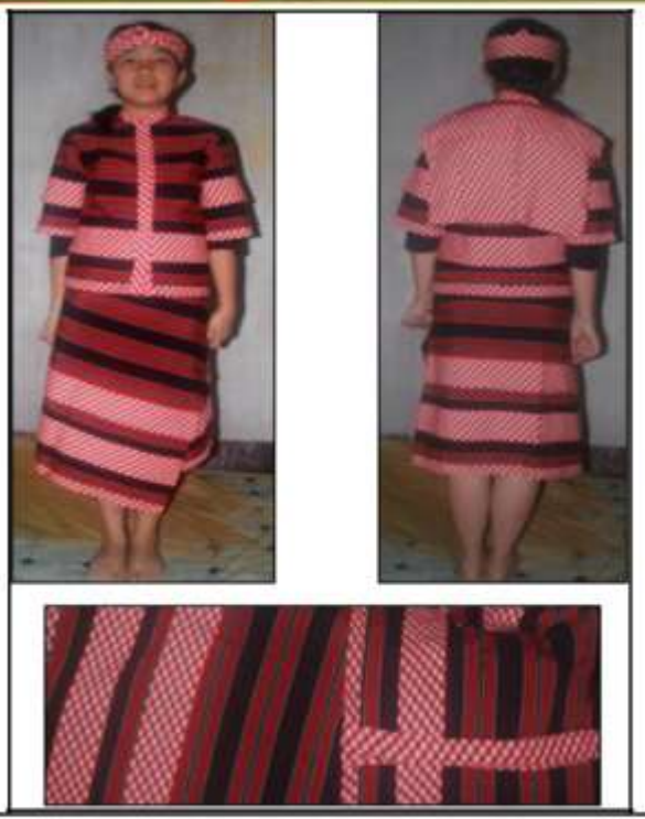
Figure 3. Clothing for women with ordinary status (an alternative of the black and white color combination)