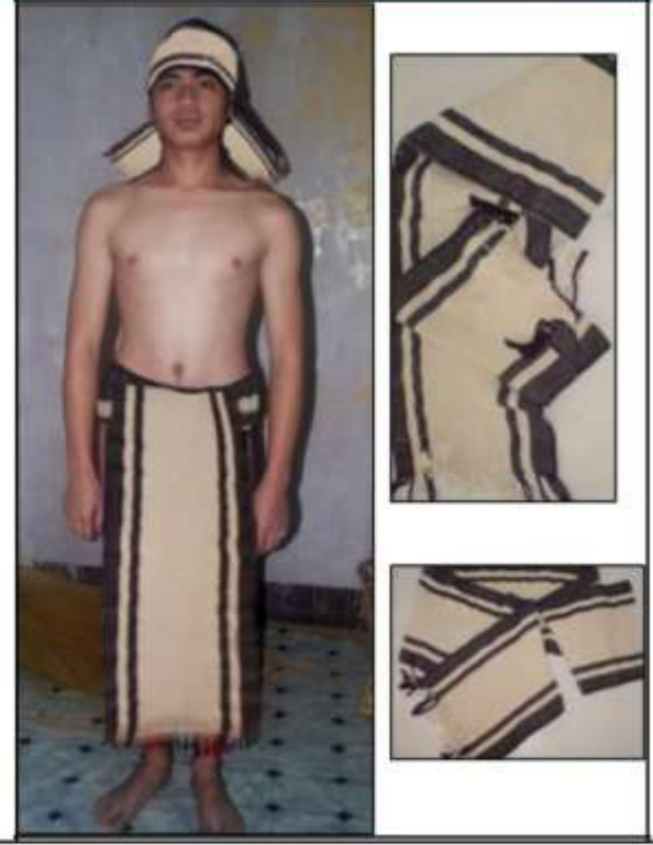
Figure 2. Clothing for men with ordinary status