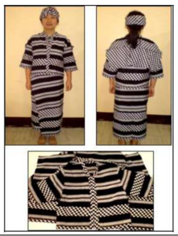
Figure 1. Clothing for women with ordinary status

Figueroa et al (2002), through their concept paper of the Integrated Model of Communication for Social Change (IMCFSC), explained that social change or any collective change in the community for that matter can occur through the important process of community dialogue.