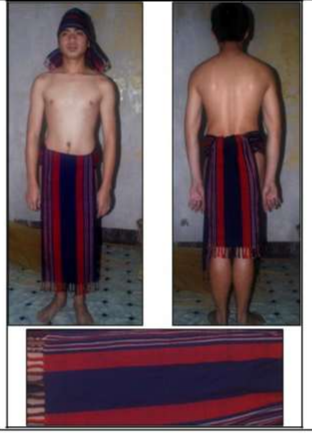
Figure 5. Clothing for men with high status