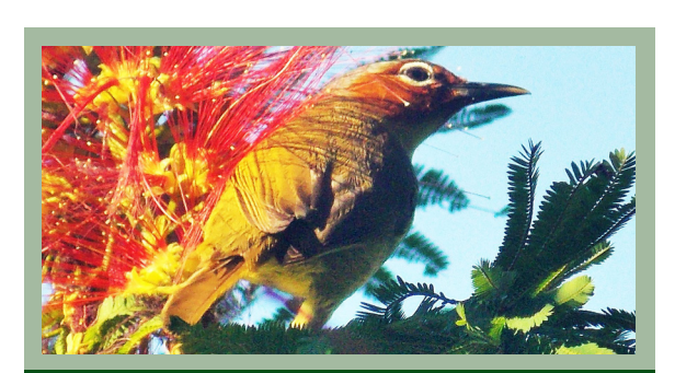
Figure 46. Chestnut-faced Babbler (Calliandra strand at the back of College of Forestry building)

Food: Feeds on seeds, berries, spiders, and were observed sucking nectars (BirdLife International, 2012,).