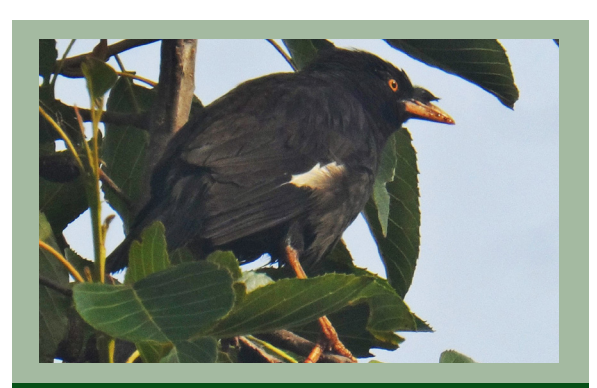
Figure 44. Crested Myna (BSU, Strawberry farm, La Trinidad)

Food : These birds eat insects, worms, and fruits like berries and bananas. These were seen sucking nectar of calliandra flowers at the Benguet State University Farm.