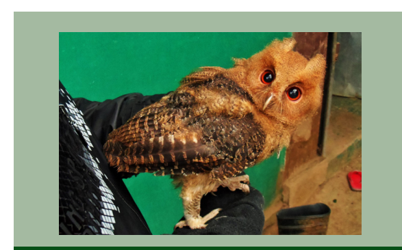
Figure 43. Philippine Scops Owl/Luzon Scops Owl (Tabangaoen Forest, Balili, La Trinidad)

Food: Philippine Scops Owls are nocturnal, that is, they find their food at night. They feed on varieties of insects, rodents, and lizards (Rabor, 1977).