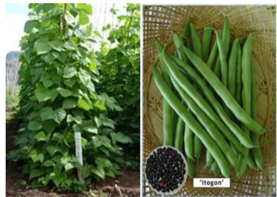
Figure 5. The plants and pods of pole snap bean NSIC 2009 PSnBn4 “Itogon”