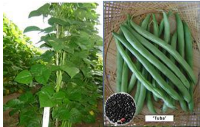
Figure 7. Plants and pods of pole snap bean NSIC 2009 PSnBn6 “Tuba”

an average fresh pod yield of 14.50t/ha, a 34.01% yield advantage over ‘Alno’, the check variety, and has an ROI of 168.85%. “Wangal” is highly resistant to bean rust and is adapted both to mid and high elevation areas during the dry season. It has darker green pods that are longer and more snappy than the check variety. It is harvestable at 54 DAE almost similar to ‘Alno’ but has longer harvesting period.