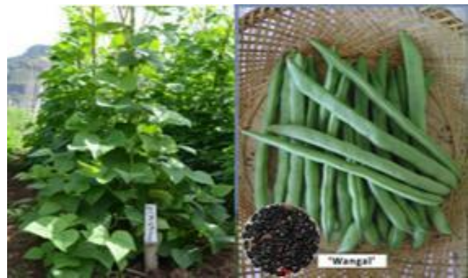
Figure 8. Plants and pods of pole snap bean NSIC 2009 PSnBn7 “Wangal”