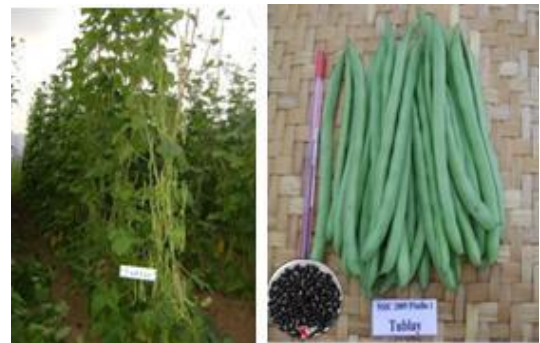
Figure 4. The plants and pods of pole snap bean NSIC 2009 PSnBn 3 “Tublay”