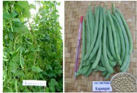
Figure 2. The plants and pods of pole snap bean NSIC 2008 PSnBn 1 “Kapangan”

“ITOGON” (NSIC 2014 PSBn4) is also a highly prolific selection from an introduction from the International Center for Tropical Agricultural (CIAT). It has an average yield of 15.08t/ha, with 39.37% yield advantage and 79% ROI over the