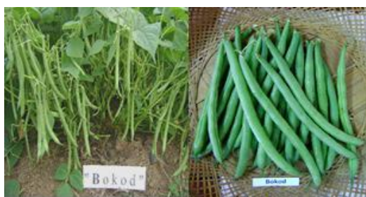
Figure 10. Plants and pods of bush snap bean NSIC 2009 BSnBn2 ,“Bokod”

“Bokod” (NSIC 2009 BSnBn2) is a selection from an introduced accession also from the CIAT. It has smoother, snappier and darker green pods and with higher resistance to bean weevil than the check variety, ‘BBL 274’. Bokod has an average yield of 9.29t ha -1 (Table 6). It has shorter, and tastier straight green pods than ‘BBL 274’ measuring 13.4 cm long and 0.90 cm wide (Figure 5). It is very much liked by farmers and consumers because it has comparable moderate resistance to bean rust with ‘BBL 274’. It could be profitably grown both in the highlands and lowlands, and has resistance to pod borer and stem breakage or lodging than BBL 274 whose stems easily break or lodge.