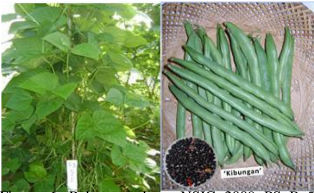
Figure 6. Pole snap bean NSIC 2009 PSnBn5 “Kibungan” plants and pods

“Kibungan” (NSIC 2009 PSnBn5) is a progeny of a cross between “Alno” and “Blue Lake” from 1996 hybridization activities. It is the first locally-bred variety recommended for registration and commercialization in Benguet. It has an average fresh pod yield of 14.40 t/ha, with 33% advantage over the check variety “Alno” and ROI of 170%. “Kibungan” is adapted to high elevation areas during the dry season. It has dark green pods that can be harvested at 52 DAE. It is longer, smoother-textured and has shinier pods than “Alno”. It is highly resistant to bean rust and to pod borer.