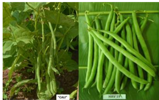
Figure 11. Plants and pods of bush snap beans Hab 19, officially registered as NSIC 2015 BSnBn 3 “Cali”

and lowlands. It is more resistant to lodging and stem breakage and weevil than ‘BBL 274’.