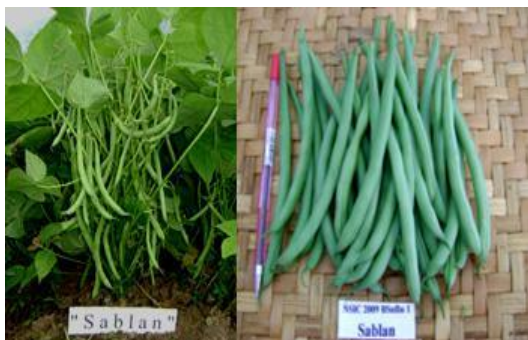
Figure 9. Plants and pods of bush snap bean NSIC 2009 BSnBn1, “Sablan”

resistant to lodging and stem breakage and has moderate resistance to bean weevil.