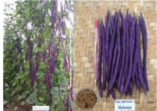
Figure 3. The plants and pods of pole snap bean NSIC 2008 PSnBn2 “Mabunga”