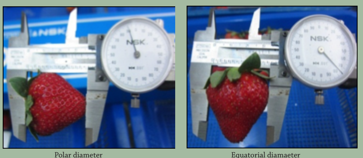
Figure 2. Measurement of fruit diameter in the study

However, significant differences were observed in sub-cultures of both 'Sweet Charlie' and 'Festival' in terms of number of days from fruit setting to first harvest. Fruits of S6 under 'Sweet Charlie' matured significantly earlier at 17.33 days followed by S8 and S10 at 18.33 and 19 days, respectively. For variety 'Festival', fruits of S10 matured significantly earlier at 12.67 days from fruit set while S3 was the last to be harvested after 19.87 days.