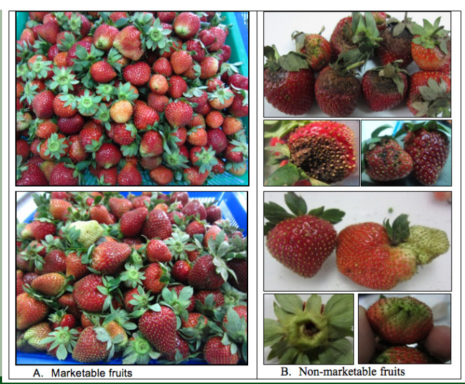
Figure 4 . Marketable vs non-marketable fruits harvested in the study in the locality

from S9 treatment, comparable to that of S2, S5, and S6. In 'Festival', the lowest non-marketable yield was recorded from S2 at 111.2g/2.5m^2 plot. This result is comparable to that from S4 to S10.