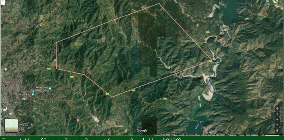
Figure 1. Map of Loacan, Itogon, Benguet

As an alternative to the free prior informed consent (FPIC) mandated by the National Commission on Indigenous People, community consultations were conducted to inform the participants about the objectives, significance and data gathering processes of the study. The meeting was attended by the barangay captain, barangay councilmen, president of the mining association and some members/representatives of the community. After the community consultation session, a written informed consent was secured to solicit the voluntary participation of the key informants. They were informed that they can retract their participation any time they feel uncomfortable during the study. This was also stated in the agreement that they signed before the start of data gathering. The consent was written in English but it was explained to them in their local dialect.