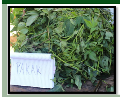
Figure 1 Second Batch of Distributed Planting Materials in Barangay Palina, Kibungan, Benguet

During the monitoring activities done in 2018, only the partners in Sitio Legleg and one from Sitio Poen were able to successfully propagate the planting materials provided. Though the other