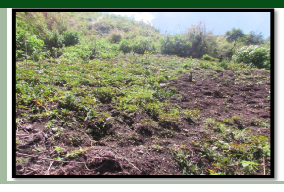
Figure 4 Sweetpotato Garden of Dominga from Sitio Agadangan, Barangay Palina, Kibungan