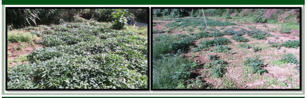
Figure 3 Existing Sweetpotato Area of Farmer Albina in Sitio Paoay, Palina, Kibungan, Benguet